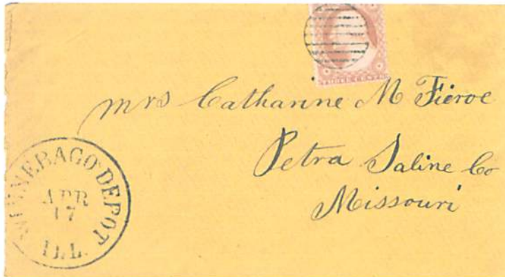
Winnebago Depot ILL. Apr 17 (185x). 37mm CDS very sharp circle grid killer with 7 bars. Due to their size, these postmarks are referred to as "balloons".