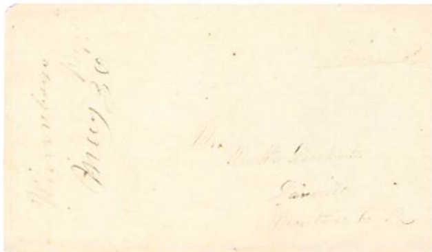
Winnebago Depot May 30 (185x). Manuscript Paid 3. Early stampless use from 1854 or 1855 before stamps were required on January 1, 1856.

Winnebago Depot was opened as a stop on the original Galena & Chicago Union Railroad about seven miles west of Rockford. On January 29, 1871 the name was shortened to Winnebago.